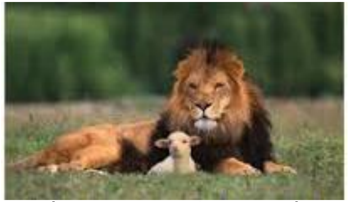
[Editor's note: Think Chronicles of Narnia by C.S. Lewis?]